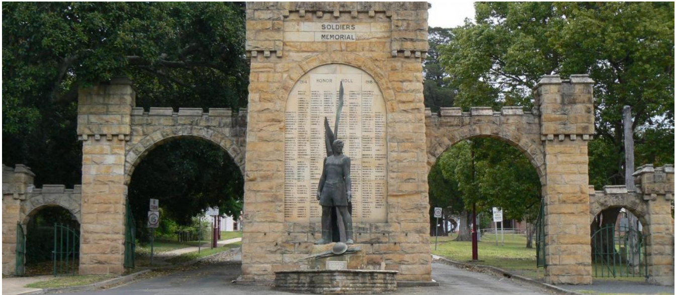
Nowra Soldiers Memorial